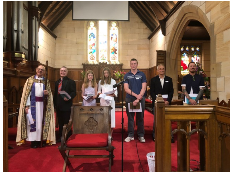
Confirmation service at St Michael's

In 2022 we saw 5 members of our congregation confirmed. We thank the Lord for His work in their lives.