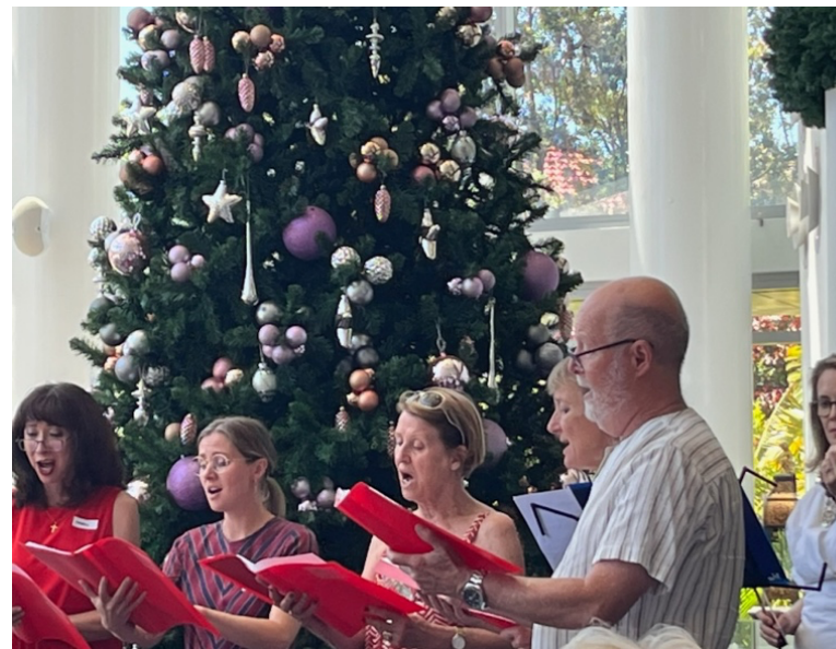
A Christmas event held by SHAP at Moran with choir, musicians, and Christmas Carols