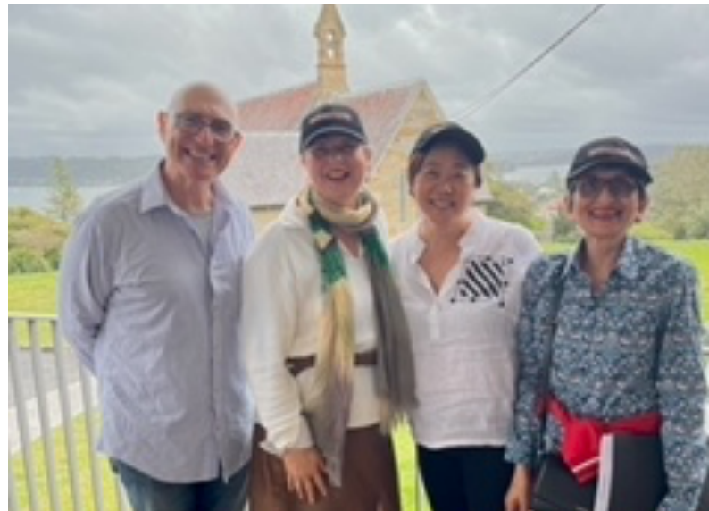
Roughtober Sleepout Team

As well as regularly supporting homeless and marginalised people in the city through 'Rough Edges', we also partner with 'Banksia Women' who offer caring advice and support to women fleeing domestic violence.