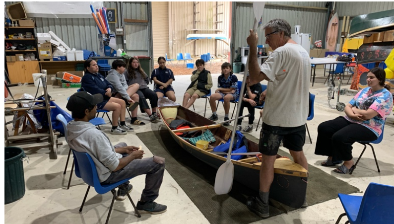
Eden Canoes Project

We partner with the ASC to highlight the plight of the thousands of asylum seekers both here and offshore. We regularly encourage people to donate grocery gift cards and make financial donations. In 2023 we hope to partner with the charity, 'Mummies Paying It Forward', who provide baby clothes & equipment to asylum seeking families.