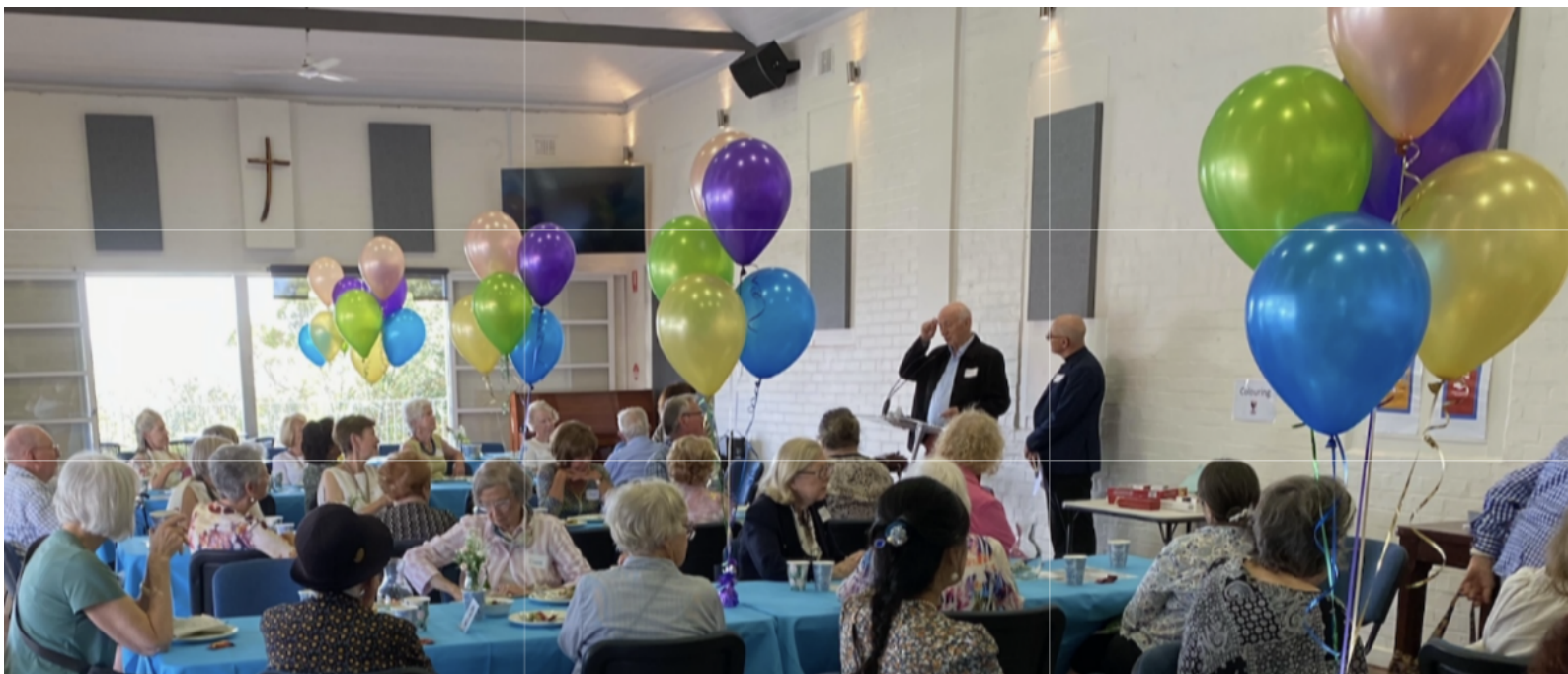
Community Lunch in 2022