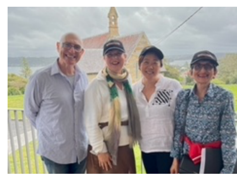
Roughtober Sleepout Team

As well as regularly supporting homeless and marginalised people in the city through 'Rough Edges', we also partner with 'Banksia Women' who offer caring advice and support to women fleeing domestic violence.