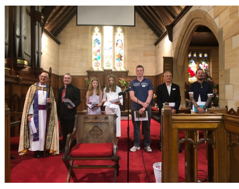
Confirmation service at St Michael's

In 2022 we saw 5 members of our congregation confirmed. We thank the Lord for His work in their lives.