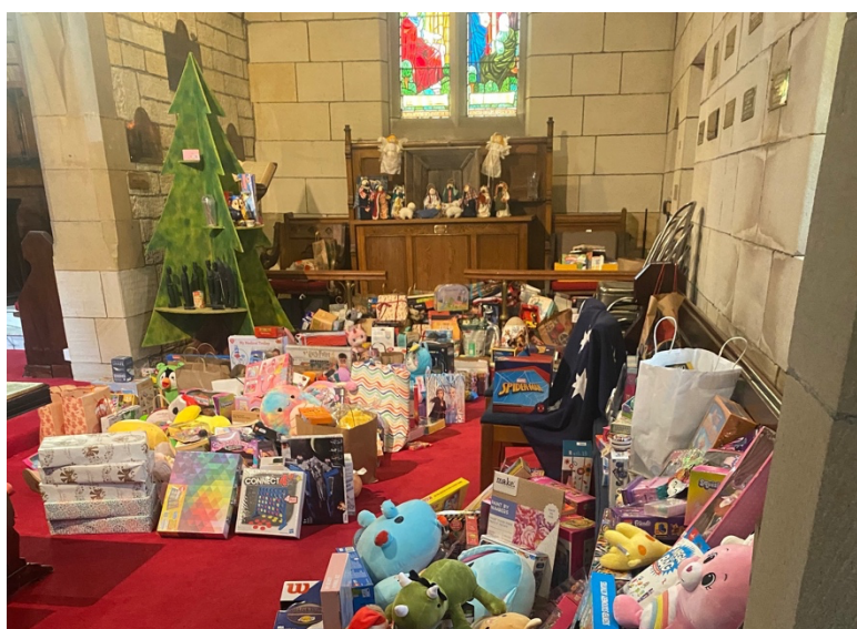
100 boxes filled for Toys 'n' Tucker