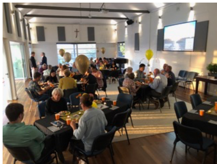
Supper at Sunset event raising $11,300 for the ministry at One For Life Church, Redfern

With the support of Kambala Junior School and Cranbrook Pre-School we had another wonderful response to the Christmas 'Toys 'n' Tucker Appeal' and managed to fill 100 boxes.