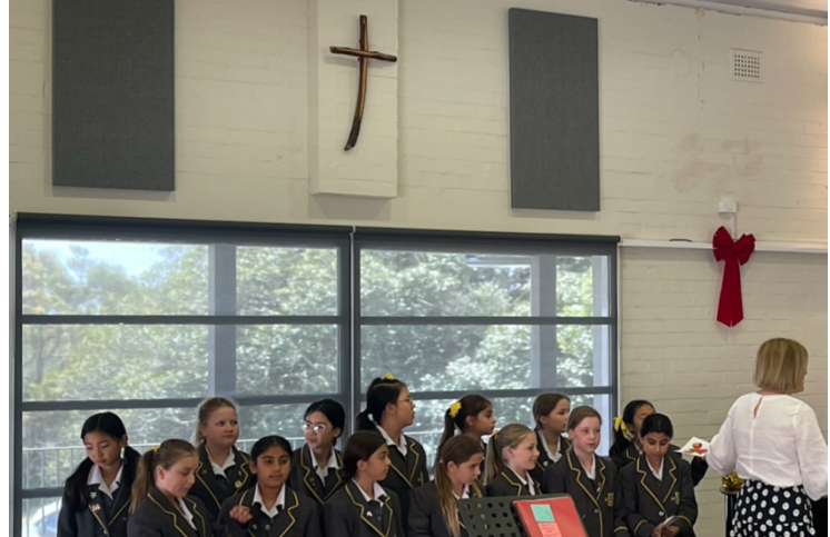
Kambala Choir at one of our Community Lunches

There are still more questions for us to ask and answer with the renewal of children's ministry at St Michael's being an absolute priority for our mission. We need to start considering what it means for us as a multi-site parish to do ministry effectively on a Sunday. To this end, a survey was released at the beginning of February to discern our Sunday life as a parish as we look to the future.