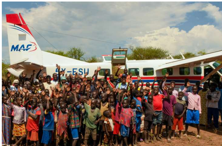
MAF recipients in front of plane