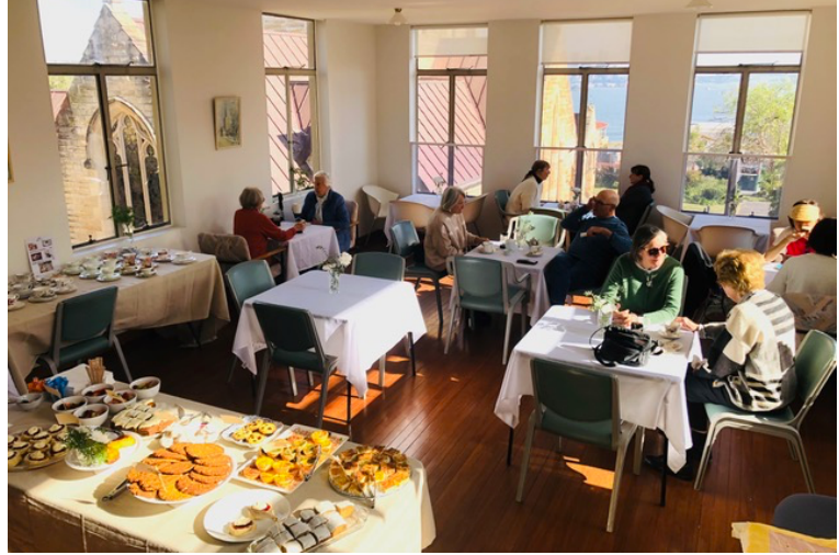
The Tea Room, with all funds donated to Banksia Women