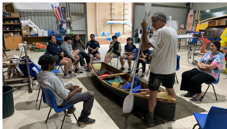
Eden Canoes Project