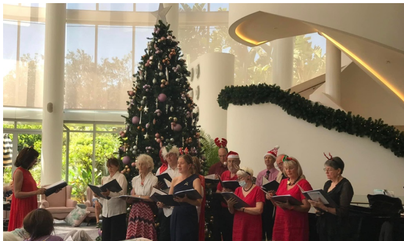
Christmas Carols held by SHAP at Moran